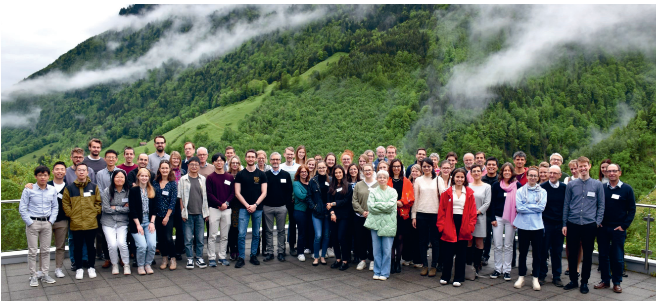
Group picture of members of the SKINTEGRITY.CH consortium at their Annual Retreat.

These respectfully critical, yet constructive and supportive discussions have already started to bear fruit: several of the researchers mentioned in their presentations that they showed results from collaborations initiated at SKINTEGRITY.CH Annual Retreats of previous years. It will be exciting to see in the upcoming years, which collaborative projects commenced this time in Emmetten.